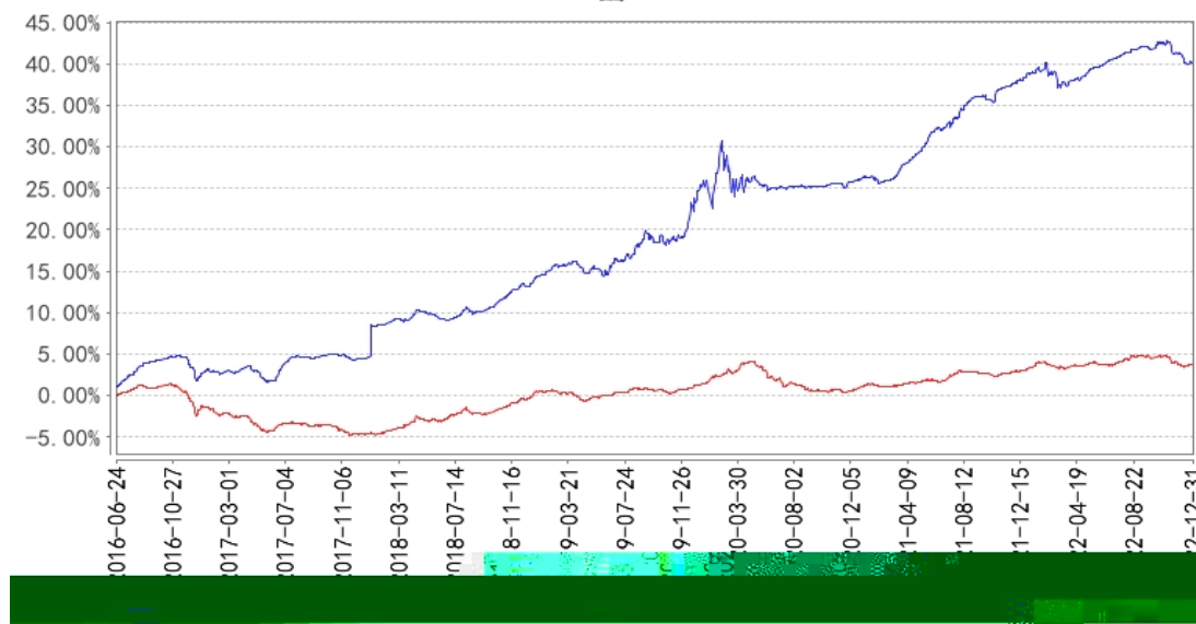
长信利众债券 (LOF) A 累计净值增长率与同期业绩比较基准收益率的历史走势对比图